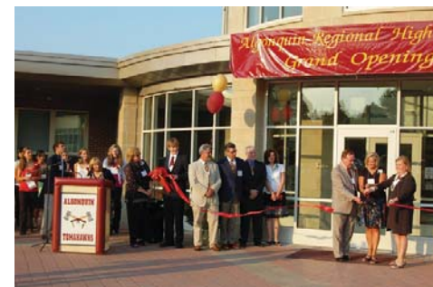
Algonquin Regional High School Grand Opening Ribbon Cutting in September.