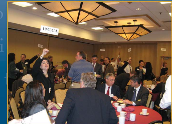
Speed Networking Table Changes.