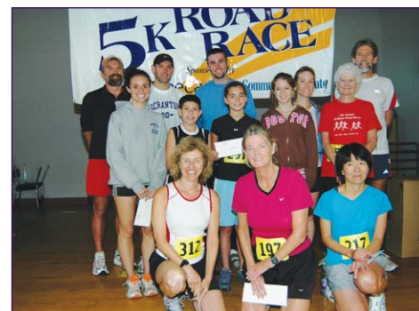
The Road Race Winners! Overall winners and First Place Division Winners.