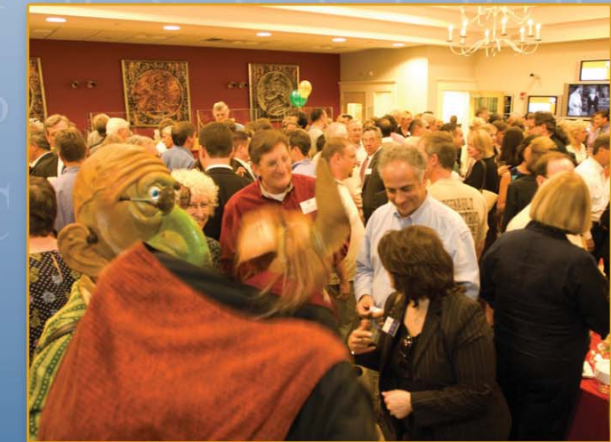
Webster Five Cents Savings Bank, Shrewsbury: 200 wall to wall members pack the September Business After Hours.